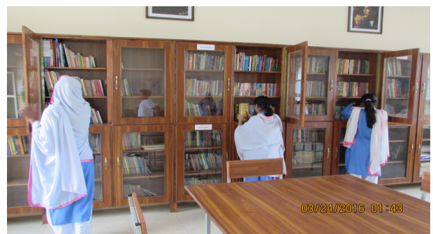
Sources: Picture is taken from a government school at Islamabad