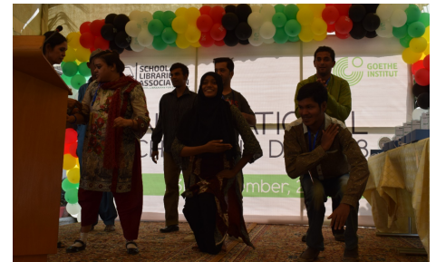
Differently abled children presented their efforts

be considered inclusive of all educational endeavours. Approximately 25 schools and 60 students participated in the events and competitions.