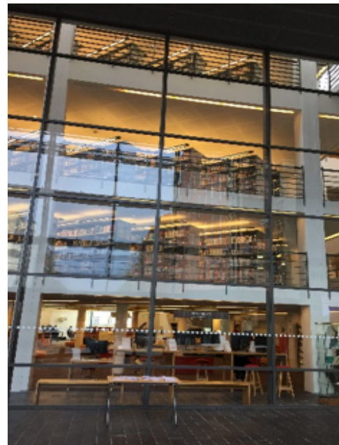
University of Borås in Sweden

I knew of this situation to some degree, which was my impetus to work with Borås school library science faculty. The faculty are overhauling their curriculum so I worked with them, with special attention to preparing school librarians with teaching backgrounds. The faculty will offer the revised curriculum in 2020. I also guest lectured in three courses, conducted a research seminar on fake news, presented about school librarian preparation