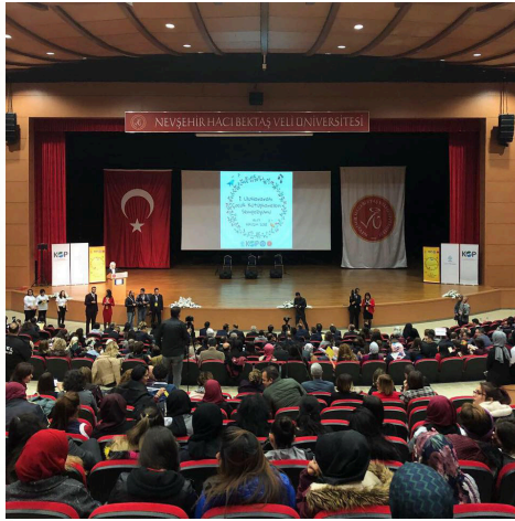
Opening Ceremony of the First International Children's Libraries

The International Children's Libraries Symposium was held for the first time in Turkey on 14-17 November 2018. The symposium was organized by Information and Records Management of Marmara University, Culture and Tourism Libraries & Publications General Directorate and Turkey Ministry of Development Directorate of KOP Regional Development Administration.