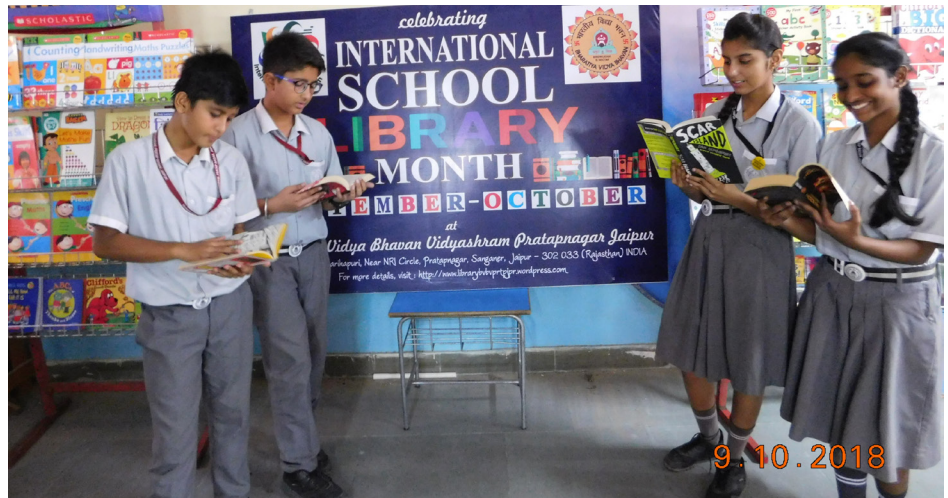
Students at Bharatiya Vidya Bhavan Vidyashram Pratapnagar

Day 2: Interclass Book talk competition was organized on October 8, 2018, for classes V and VI. Total 16 students participated wholeheartedly in the competition. 2 students from each section were selected by the respective English teachers. Students were instructed to select books by Ruskin Bond, Jeff Kinney, G. Stilton, and Roald Dahl. They chose their books accordingly and prepared excellent talks on the same. While presenting the talk they included author's name, characters, Storyline and; motivated others students to grab the book and read it. It went as a successful competition as the students came to know about different interesting books.