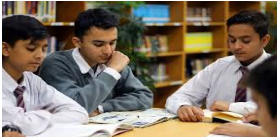
Picture is taken from City School : A private schools system in Pakistan

The schooling system in Pakistan is improving gradually. The Private