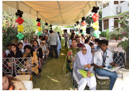
The esteemed audience for the day

Students from different schools from Karachi actively participated in the event. Differently abled children also demonstrated their talents, skills and abilities on the day, with reminder that they should