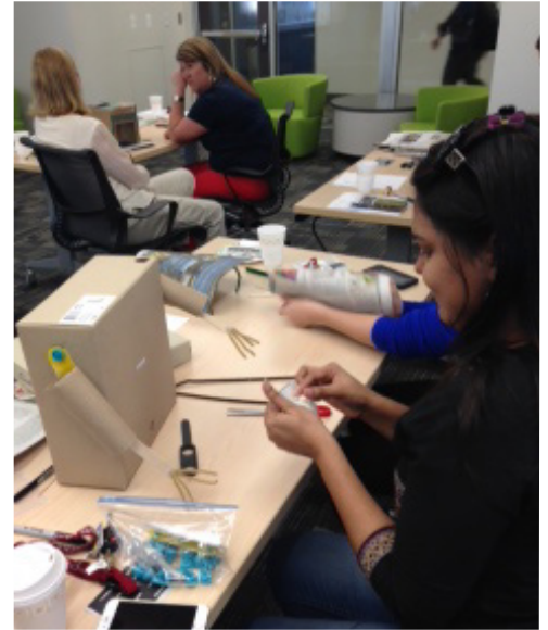
Makerspace workshops for librarians