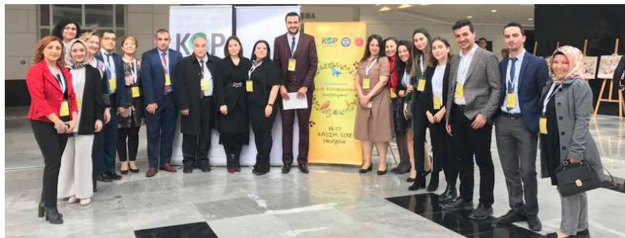
Part of the organization committee of symposium-Marmara University academicians, students and librarians

Reference: "First International Children's Libraries Symposium"