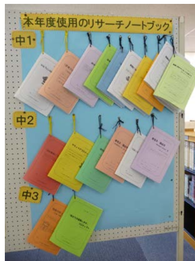
Figure 1: Research Notebooks

The library itself is set up with teaching areas equipped with interactive whiteboards connected to the internet. The teaching areas can be booked by any subject teacher, but they are mainly used for our three-year critical thinking skills training course, taught in junior high. These CT skills lessons are held twice a week for the 7th and 8th grade students, and once a week for the 9th grade students. The majority of the lessons for the CT course are conducted with the help of the librarian. In the first few lessons, she teaches the students useful library skills, and throughout the three years, she supports the teachers and edits the Research Notebooks(Figure 1) that accompany the program.